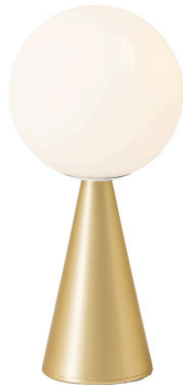
Table lamp with diffused light not dimmable. Brushed brass frame. Diffuser made of white blown glass with satin-finish. Transparent power cable, plug and switch. European two-pole plug. Bulb not included.

Nothing more than a sphere, set in an apparently impossible feat of balance, upon a cone that serves as the base. One of Gio Ponti's many compositional magic tricks, designed in 1932. The counterbalancing of two elementary geometric forms results in an original, perfectly proportioned object. An unpretentious composition, enriched by the extraordinary balance of its proportions and the stylish discretion of non-reflective materials. The light is diffused and valorized by the geometrical simplicity of the design. In designing Bilia, Gio Ponti imagined a smaller version in a range of "spray colours". From those handwritten notes of the original project, FontanaArte presents Bilia Mini in new breathtaking chromatic variations.