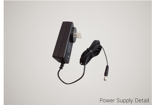
Power Supply Detail