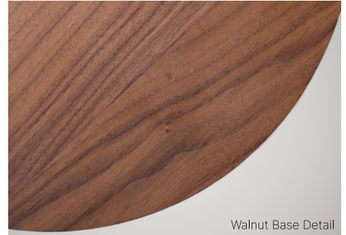
Walnut Base Detail