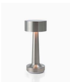
Anodised Silver Aluminium