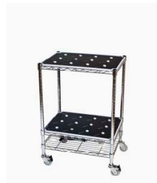
Small Recharging Trolley 24 Lamps