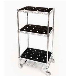
Medium Recharging Trolley 36 Lamps