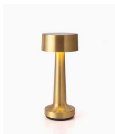
Lacquered Real Brass