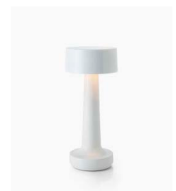
Baked Enamel Gloss Ivory White Aluminium