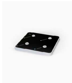
Small Recharging Tray 4 Lamps