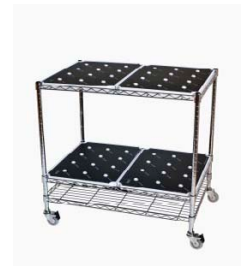
Large Recharging Trolley 48 Lamps