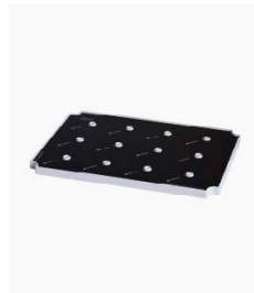
Large Recharging Tray 12 Lamps