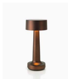
Anodised Satin Bronze Aluminium