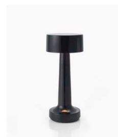
Anodised Satin Black Aluminium