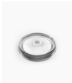
Single Base Station 1 Lamp