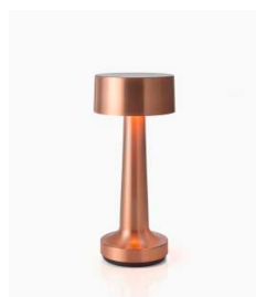
Lacquered Real Copper