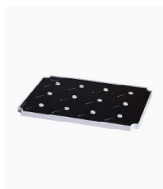
Large Recharging Tray 12 Lamps