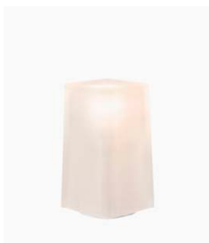
Sand Blasted Pressed Glass