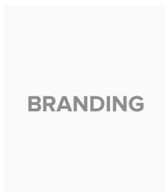
Commercial Customisation Logos