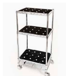
Medium Recharging Trolley 36 Lamps