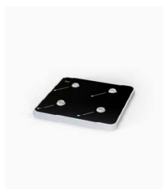
Small Recharging Tray 4 Lamps