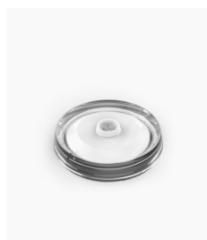
Single Base Station 1 Lamp

100 - 240V Switch-Mode Electronic Power Supply Approved for worldwide usage supplied with appropriate mains electric plug type