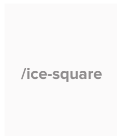
Online Product Page