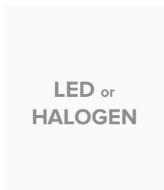
Optional Halogen Light Source