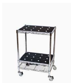
Small Recharging Trolley 24 Lamps