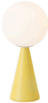
Table lamp with diffused light not dimmable. Painted metal frame. Diffuser made of white blown glass with satin-finish. Transparent power cable, plug and switch. European two-pole plug. Bulb not included.

Nothing more than a sphere, set in an apparently impossible feat of balance, upon a cone that serves as the base. One of Gio Ponti's many compositional magic tricks, designed in 1932. The counterbalancing of two elementary geometric forms results in an original, perfectly proportioned object. An unpretentious composition, enriched by the extraordinary balance of its proportions and the stylish discretion of non-reflective materials. The light is diffused and valorized by the geometrical simplicity of the design. In designing Bilia, Gio Ponti imagined a smaller version in a range of "spray colours". From those handwritten notes of the original project, FontanaArte presents Bilia Mini in new breathtaking chromatic variations.