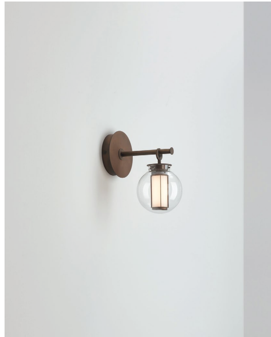
Bai A Di Di