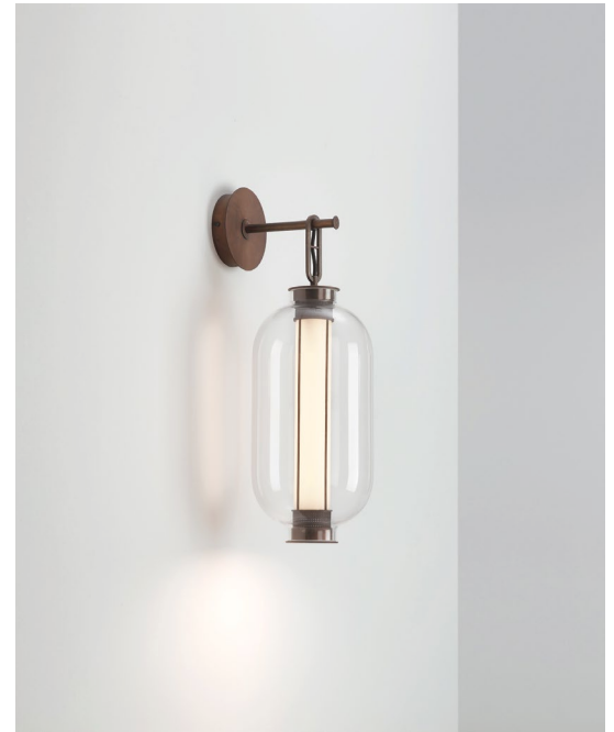
Bai A Ba Ba (Indoor & Outdoor)