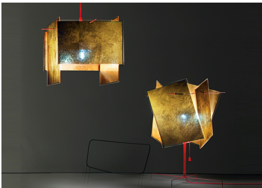
24 Karat Blau AXEL SCHMID 2005

24 Karat Blau by designer Axel Schmid is part of and gives its name to an entire family of lamps by Ingo Maurer. Four shades with gold leaf cast in acrylic glass, metal, plastic: The gold shades of the luminaire each have four holes with which they can be hung on the red rod cross at different angles, in portrait or landscape format. The 24-carat gold leaf shades are made individually by hand. Gold leaf is real gold. It is beaten wafer-thin with a hammer by gold beaters. The gold leaf is beaten 1/10,000 mm thin - the equivalent of 1,000 atomic layers - so that short-wave blue light can shine through between the molecules, while yellow-gold light is reflected. Thanks to the special beating technique, the wafer-thin gold leaf displays a beautiful star-shaped pattern. Axel Schmid deliberately opted for real gold: "With real gold, the energy stays there - inside the luminaire. No gold paint can imitate that. With real gold, there is also the surface structure. In combination with acrylic, precious gold leaf is brought into a format that is easy to handle and maintain." The colors red (rods and cable) and blue (light point) form a beautiful contrast to the gold. 24 Karat Blau can be extended as required: 24 Karat Blau M is the name of the extension module that turns a single 24 Karat Blau into a larger pendant luminaire.