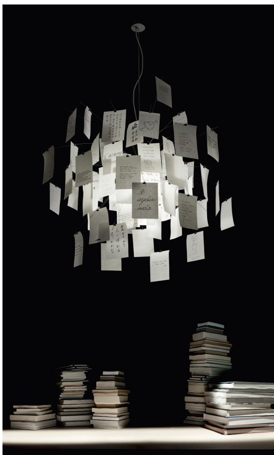
Zettel'z 5 INGO MAURER 1997

Stainless steel, heat-resistant satinised glass, Japanese paper. 31 printed and 49 blank sheets DIN A5. Zettel'z 5 is one of Ingo Maurer's best-known lamps. It gives the user plenty of room for creativity. It can be arranged to fill the space, loosely or narrowly and densely. The blank sheets can be used for your own messages or sketches. The Japanese paper is very thin and translucent. Two light sources provide ambient lighting and downward light, e.g. for a table surface.