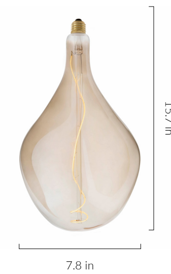
BEST PAIRED WITH

Warm up time: Instant Warranty: 3 years Input Voltage: 110-120V