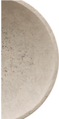
Light Grey (LHT)