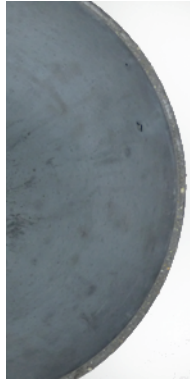
Dark Grey (DRK)