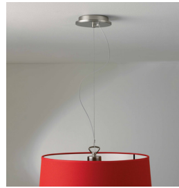
CODE: 1184003 FINISH: MATT NICKEL