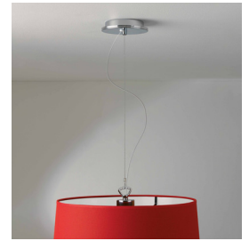
CODE: 1184004 FINISH: POLISHED CHROME

TO MAINTAIN THIS PRODUCT TO ITS BEST CONDITION, PLEASE VIEW OUR CARE AND CLEANING GUIDE ON THE SUPPORT SECTION OF THE ASTRO WEBSITE.