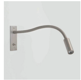
CODE: 1295002 FINISH: MATT NICKEL