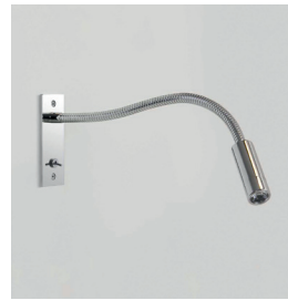
CODE: 1295001 FINISH: POLISHED CHROME