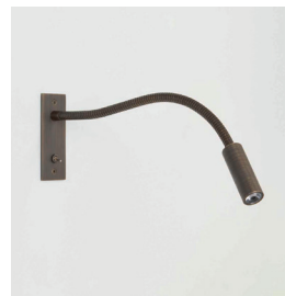
CODE: 1295003 FINISH: BRONZE

TO MAINTAIN THIS PRODUCT TO ITS BEST CONDITION, PLEASE VIEW OUR CARE AND CLEANING GUIDE ON THE SUPPORT SECTION OF THE ASTRO WEBSITE.