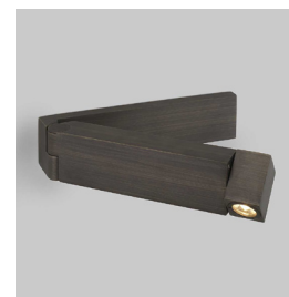
CODE: 1157012 (8223) FINISH: BRONZE

TO MAINTAIN THIS PRODUCT TO ITS BEST CONDITION, PLEASE VIEW OUR CARE AND CLEANING GUIDE ON THE SUPPORT SECTION OF THE ASTRO WEBSITE.