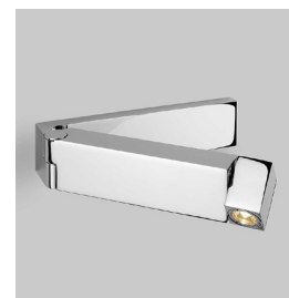
CODE: 1157003 (0850) FINISH: POLISHED CHROME