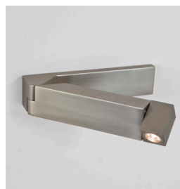
CODE: 1157001 (0699) FINISH: MATT NICKEL