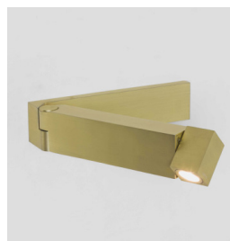
CODE: 1157007 (7548) FINISH: MATT GOLD