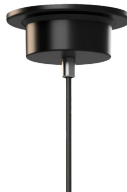
Ceiling Rose with adapter plate