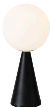
Table lamp with diffused light not dimmable. Painted metal frame. Diffuser made of white blown glass with satin-finish. Transparent power cable, plug and switch. European two-pole plug. Bulb not included.

Nothing more than a sphere, set in an apparently impossible feat of balance, upon a cone that serves as the base. One of Gio Ponti's many compositional magic tricks, designed in 1932. The counterbalancing of two elementary geometric forms results in an original, perfectly proportioned object. An unpretentious composition, enriched by the extraordinary balance of its proportions and the stylish discretion of non-reflective materials. The light is diffused and valorized by the geometrical simplicity of the design. In designing Bilia, Gio Ponti imagined a smaller version in a range of "spray colours". From those handwritten notes of the original project, FontanaArte presents Bilia Mini in new breathtaking chromatic variations.