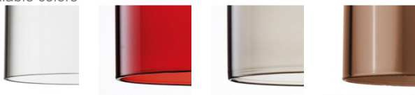
CS Crystal RS Red GR Grey BR Metallic bronze

12V - EELc (Energy Efficiency Label compatibility): C , B