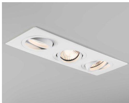
CODE: 1240019 (5650) FINISH: MATT WHITE

TO MAINTAIN THIS PRODUCT TO ITS BEST CONDITION, PLEASE VIEW OUR CARE AND CLEANING GUIDE ON THE SUPPORT SECTION OF THE ASTRO WEBSITE.