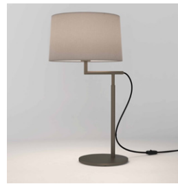
CODE: 1404006 (4598) FINISH: BRONZE

TO MAINTAIN THIS PRODUCT TO ITS BEST CONDITION, PLEASE VIEW OUR CARE AND CLEANING GUIDE ON THE SUPPORT SECTION OF THE ASTRO WEBSITE.