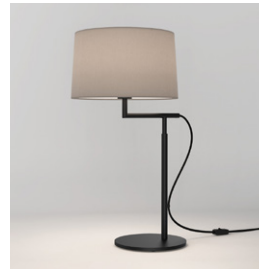
CODE: 1404004 (4596) FINISH: MATT BLACK