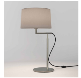
CODE: 1404005 (4597) FINISH: MATT NICKEL