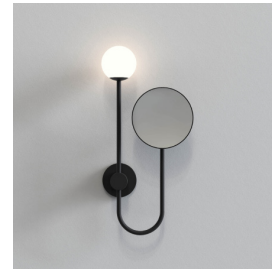
CODE: 1424003 FINISH: MATT BLACK

TO MAINTAIN THIS PRODUCT TO ITS BEST CONDITION, PLEASE VIEW OUR CARE AND CLEANING GUIDE ON THE SUPPORT SECTION OF THE ASTRO WEBSITE.