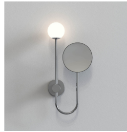
CODE: 1424001 FINISH: POLISHED CHROME