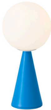
Table lamp with diffused light not dimmable. Painted metal frame. Diffuser made of white blown glass with satin-finish. Transparent power cable, plug and switch. European two-pole plug. Bulb not included.

Nothing more than a sphere, set in an apparently impossible feat of balance, upon a cone that serves as the base. One of Gio Ponti's many compositional magic tricks, designed in 1932. The counterbalancing of two elementary geometric forms results in an original, perfectly proportioned object. An unpretentious composition, enriched by the extraordinary balance of its proportions and the stylish discretion of non-reflective materials. The light is diffused and valorized by the geometrical simplicity of the design. In designing Bilia, Gio Ponti imagined a smaller version in a range of "spray colours". From those handwritten notes of the original project, FontanaArte presents Bilia Mini in new breathtaking chromatic variations.