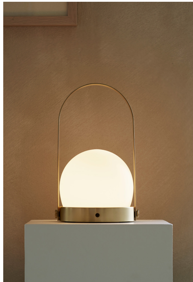
Carrie Table Lamp, Brushed Brass, by Norm Architects