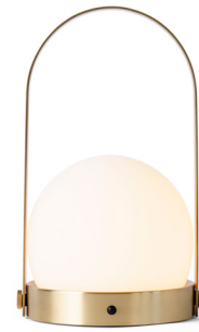
Brushed Brass 4863839