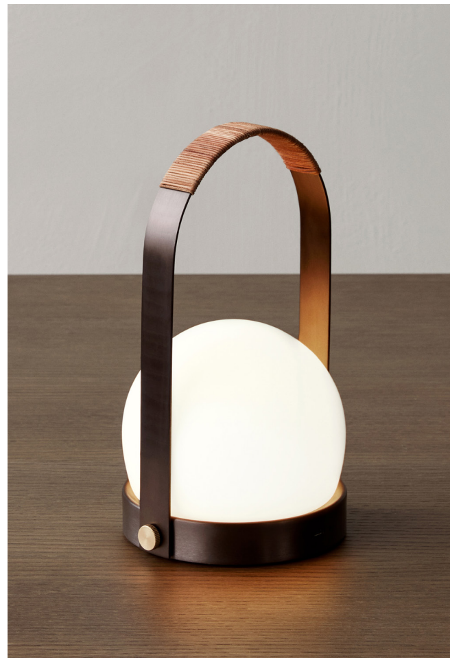
Carrie Table Lamp, Bronzed Brass, by Norm Architects