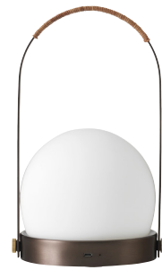
Bronzed Brass 4863859