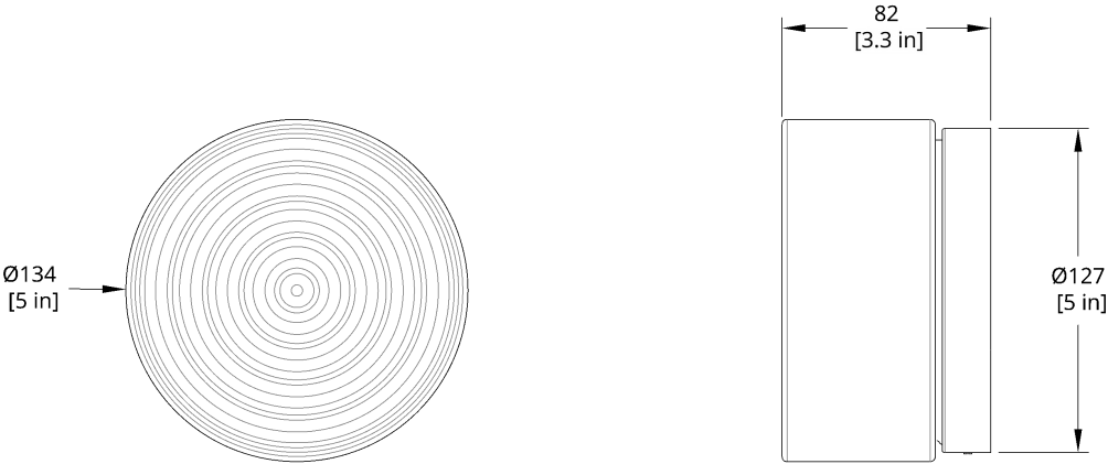
RP-WS Ripple Sconce Dimension (Rotate 90 degrees for flush mount version)