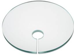
RF84656 Snoopy glass diffuser