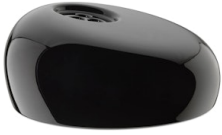
RF80966 Black reflector