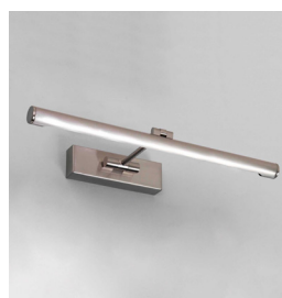
CODE: 1115009 FINISH: BRUSHED NICKEL