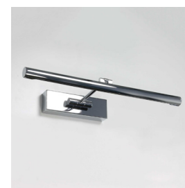
CODE: 1115010 FINISH: POLISHED CHROME