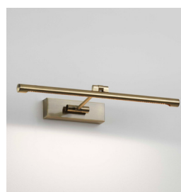
CODE: 1115013 FINISH: ANTIQUE BRASS

TO MAINTAIN THIS PRODUCT TO ITS BEST CONDITION, PLEASE VIEW OUR CARE AND CLEANING GUIDE ON THE SUPPORT SECTION OF THE ASTRO WEBSITE.