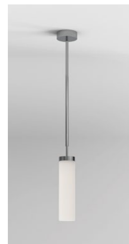
CODE: 1060007 (8523) FINISH: POLISHED CHROME

TO MAINTAIN THIS PRODUCT TO ITS BEST CONDITION, PLEASE VIEW OUR CARE AND CLEANING GUIDE ON THE SUPPORT SECTION OF THE ASTRO WEBSITE.