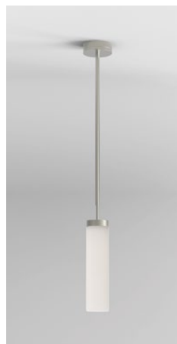
CODE: 1060008 (8559) FINISH: MATT NICKEL