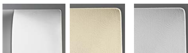
BC White FA Ivory pattern FB White pattern

EELc (Energy Efficiency Label compatibility): E, D, C, B, A, A+, A++