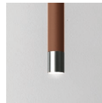
12 rust brown wrinkled final black polished nickel