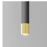
11 anthracite grey wrinkled - final polished gold