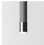
10 anthracite grey wrinkled - final black polished nickel