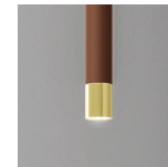
13 rust brown wrinkled final polished gold

EELc (Energy Efficiency Label compatibility) contain built in LED lamps that cannot be changed: A, A+, A++