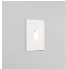
CODE: 1175006 FINISH: MATT WHITE