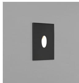
CODE: 1175009 FINISH: TEXTURED BLACK