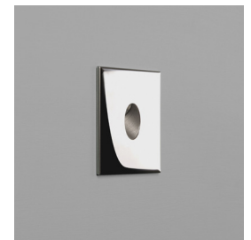
CODE: 1175010 FINISH: POLISHED STAINLESS STEEL

TO MAINTAIN THIS PRODUCT TO ITS BEST CONDITION, PLEASE VIEW OUR CARE AND CLEANING GUIDE ON THE SUPPORT SECTION OF THE ASTRO WEBSITE.