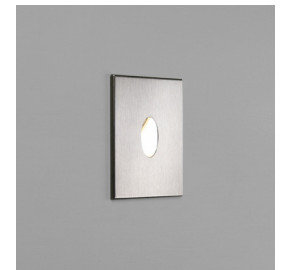
CODE: 1175007 FINISH: BRUSHED STAINLESS STEEL