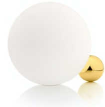
Table lighting fixture comprising an aluminium sphere machined from solid and then gold-coated with 24 K gold. Blown glass opal diffuser. LED light source with dimmer switch on the power cable.

Are you a professional and your project needs consulting and support?